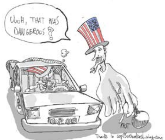
The USA need to reduce their emissions

Dec 8: US ANNOUNCED DANGER OF GREENHOUSE GAZ