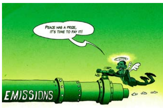
Emissions kill. Obama Nobel Prize, you should stop them !

In parallel, NGOs are increasingly excluded from negotiations, to make room for the «ballet» of Heads of State accompanied by their courtiers and servants. Shame on the United Nations, an organization that is supposed to stand up for human rights, democracy and freedom of speech ! From 10 000 observers, we go down to 5 000 and then 300 (300 badges are granted and not 90, after tough negotiations between the UNFCCC secretariat and NGO representatives). For the Climate Action Network, that means 54 badges for all environmental NGOs around the world, because we have to share the quota of 300 with private companies, Unions and local communities. For WWF International, that means 2 or 3 badges for 118 people in the delegation. The last days will be very hard. Everything seems to be put in place to facilitate the «greenwashing» of the agreement: