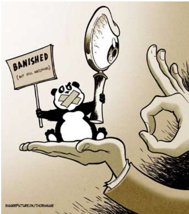
NGO banished from the negotiations

the exclusion of independent observers who would report a watered down agreement and the omnipresence of communications services from governments. Outside, the mobilization becomes better organized but also more radical, with increasingly violent actions; inside, people talk about civil disobedience; some have begun a hunger strike. The Bella Center's is closing its doors and we are isolated from the outside world for many hours.