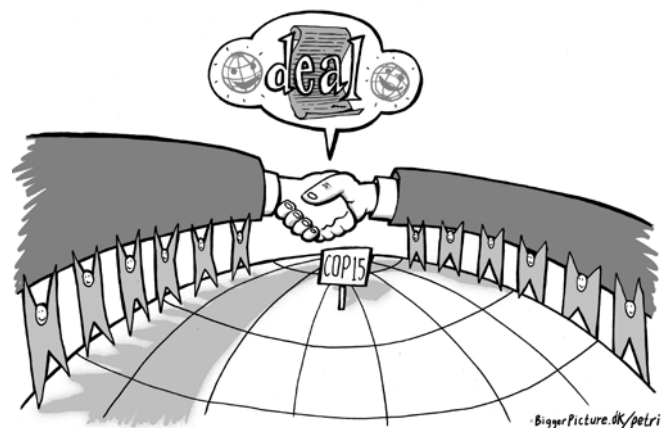
Building a stronger deal in 2010

The imperative of staying below 2 ° C (1.5 ° C) is a question of survival, whatever our nationality or our label, it has become a common goal and consensus for all humankind, beyond national borders. The fact that 27 countries were able to agree on a text, although they represent very different regions, cultures, and very divergent interests, that fact should not be lost even if the final Accord doesn't match our level of expectations. This may be the beginning of a new area beyond the usual dividing lines. Up to us to seize this opportunity to make this failure a future success.