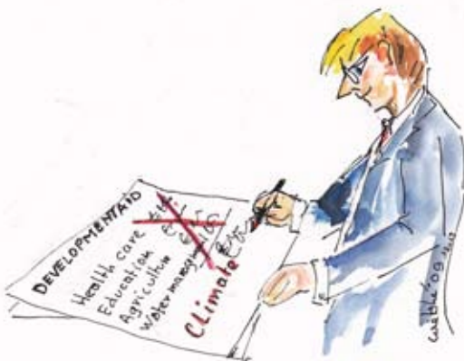
Recycling development aid

It does contain promises of funding in the short and long term, but without any guarantee that such funding will be disbursed, or that it will not just be recycling existing development aid funds and loans under the climate "label".