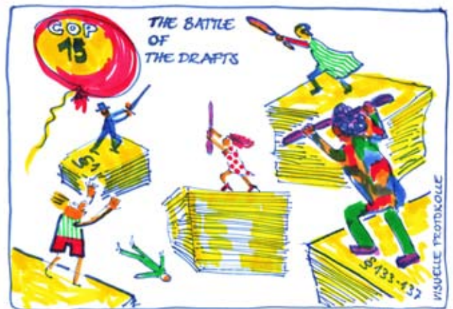
The battle of the drafts

Negotiations opened in Copenhagen with a wave of optimism. Throughout the history of climate negotiations, we had never seen such a mobilization: 45,000 registrants, including thousands of journalists, NGOs, hundreds of ministers and heads of state, all gathered in their finest attire in the conference center by Bella Vista («beautiful view»). After the depressing times of the negotiations in Barcelona, we did not expect so much!