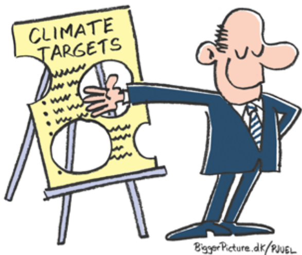
Emission targets with loopholes (forests; offsets; hot air)

In parallel, the Environment Minister Jean-Louis Borloo promises to NGOs to push the EU to adopt a 30% target for the reduction of greenhouse gas emissions on the soil of Europe, and for long term public funding for least developed countries, the most vulnerable to climate change. Meanwhile, directors of NGOs stayed behind in Paris meet President Sarkozy to hand over 500 000 signatures of citizens supporting the “Ultimatum climatique” campaign. The echo from the President is not necessarily the same as what we heard from the Environment Minister, and we are already seeing a turning point looming for the end of negotiations, when the Heads of State will replace the Ministers of Environment at the negotiating table.