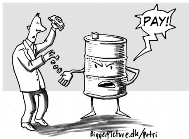
Oil hold up

The negotiation process becomes increasingly chaotic. To remedy the crisis, the Danish Presidency takes the hand on the “hot” issues: emission reduction targets (including USA, EU on one side and large emerging countries targets on the other side), and long term funding. Ministers meet in small committees to resolve problems, but meanwhile the technical negotiators discuss the same topics in parallel sessions! Rather than clearing the way, this operation further exacerbates the lack of confidence of countries in the process. On December 16, the formal sessions of the Convention and the Kyoto Protocol are supposed to conclude with the adoption of texts as a basis for negotiating the final straight, with the arrival of Heads of States the next day. The meeting on the Convention finally takes place between 2 AM and 6 AM, with a text more and more emptied of substances, and full of brackets to indicate that there is no agreement. Even on this non-agreement, there is no closing, after sharp exchanges between the United States, the first oil consumer and oil-producing countries.