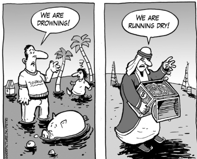
Oil producing countries and Island countries asking for financial compensations, for different reasons...

The negotiation process becomes increasingly chaotic. To remedy the crisis, the Danish Presidency takes the hand on the “hot” issues: emission reduction targets (including USA, EU on one side and large emerging countries targets on the other side), and long term funding. Ministers meet in small committees to resolve problems, but meanwhile the technical negotiators discuss the same topics in parallel sessions! Rather than clearing the way, this operation further exacerbates the lack of confidence of countries in the process. On December 16, the formal sessions of the Convention and the Kyoto Protocol are supposed to conclude with the adoption of texts as a basis for negotiating the final straight, with the arrival of Heads of States the next day. The meeting on the Convention finally takes place between 2 AM and 6 AM, with a text more and more emptied of substances, and full of brackets to indicate that there is no agreement. Even on this non-agreement, there is no closing, after sharp exchanges between the United States, the first oil consumer and oil-producing countries.