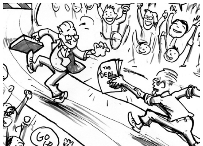
Countdown of the last 24h

Our pandas colleagues with yellow badges (NGOs) have finally all been expelled from the Bella Center at about 3 A.M. last night. This Thursday, December 17, arriving at the Bella Center, we find the WWF office's door locked, with no one inside. This was the saddest moment of the whole two weeks, thinking about my colleagues who are so dedicated and professional, and who got shamefully kicked out of the negotiations that could decide about the future of our planet. Access is limited and even the rare yellow badges can not go beyond the information center at the entrance. The atmosphere is really strange, NGOs being replaced by the comings and goings of heads of state, surrounded by their many bodyguards and followed by hysterical cameras.